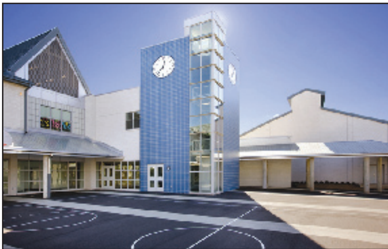
First Avenue District School, Newark, N.J.